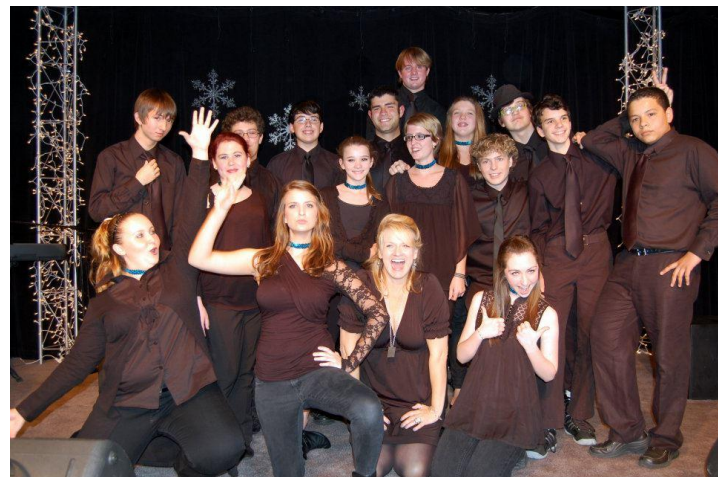
Winter's Solstice Cast & Director